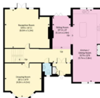
REAR GROUND FLOOR

All measurements are approximate and for guidance and illustrative purposes only. Photography and Floor Plans by www.thedowlingco.com +44 7793 934 209